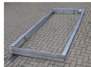
Frame folded for transportation